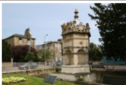
Hobson's Conduit Monument, Cambridge